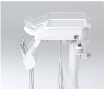
Fit your position The doctor table can be adjusted with three-level height and each dentist can position it appropriately.