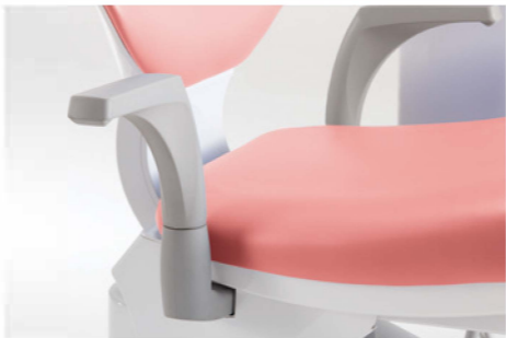
Rotating armrests The armrests are designed with a length and shape that make it easy for patients to hold, and the side-rotating mechanism helps elderly patients mount and dismount the chair with ease.